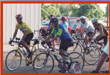
Prairie Road Tours of 15, 30 miles or the 60 mile "Border and Back" ride