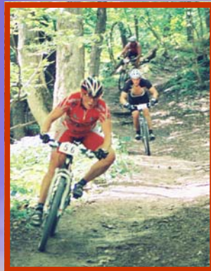
18-Mile Competitive Mountain Bike Race