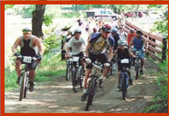
8-mile Sport Mountain Bike Ride