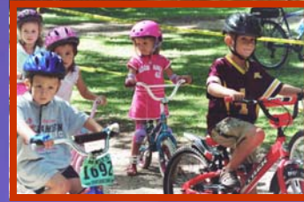
Kid's Ride in the Park

Camden State Park in Southwest Minnesota