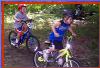
Junior Mountain Bike Ride